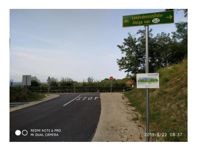
Newly built road between Slovenia and Hungary

In order to promote the EuroVelo13 cycling route, the cycling and the natural and cultural values of the border area, several events and various promotional activities were implemented