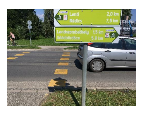
Signposting in Hungary

<u>Development of joint tourism services in order to increase the attractiveness of the connected Iron Curtain Hungarian-Slovenian cycling network</u>