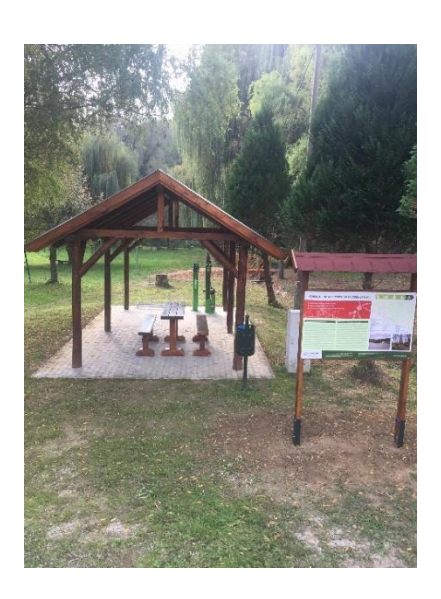
Resting places in Slovenia (Bakovci, Jeruzalem) and in Hungary (Kistolmács)