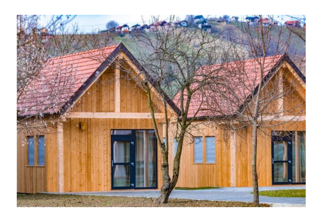
New accommodations in Čentiba