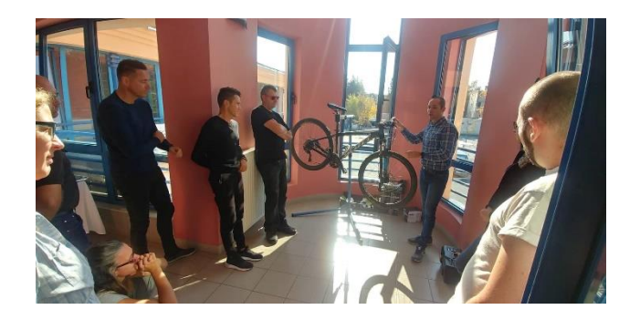
Workshop with service providers