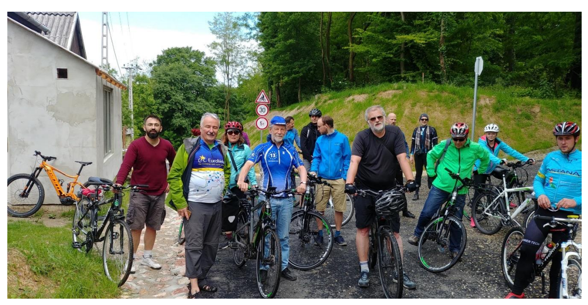
International EuroVelo13 conference and open day