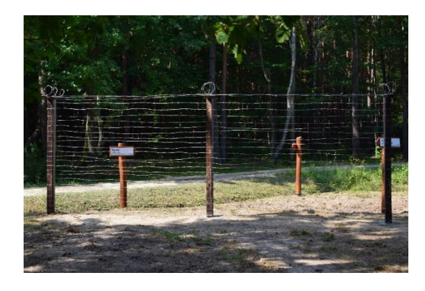
Határkőpark in Szalafő